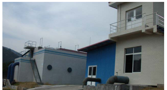
(Water pumping station of the project seen under construction)